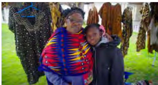
A vendor at Lake Merritt, 2023.