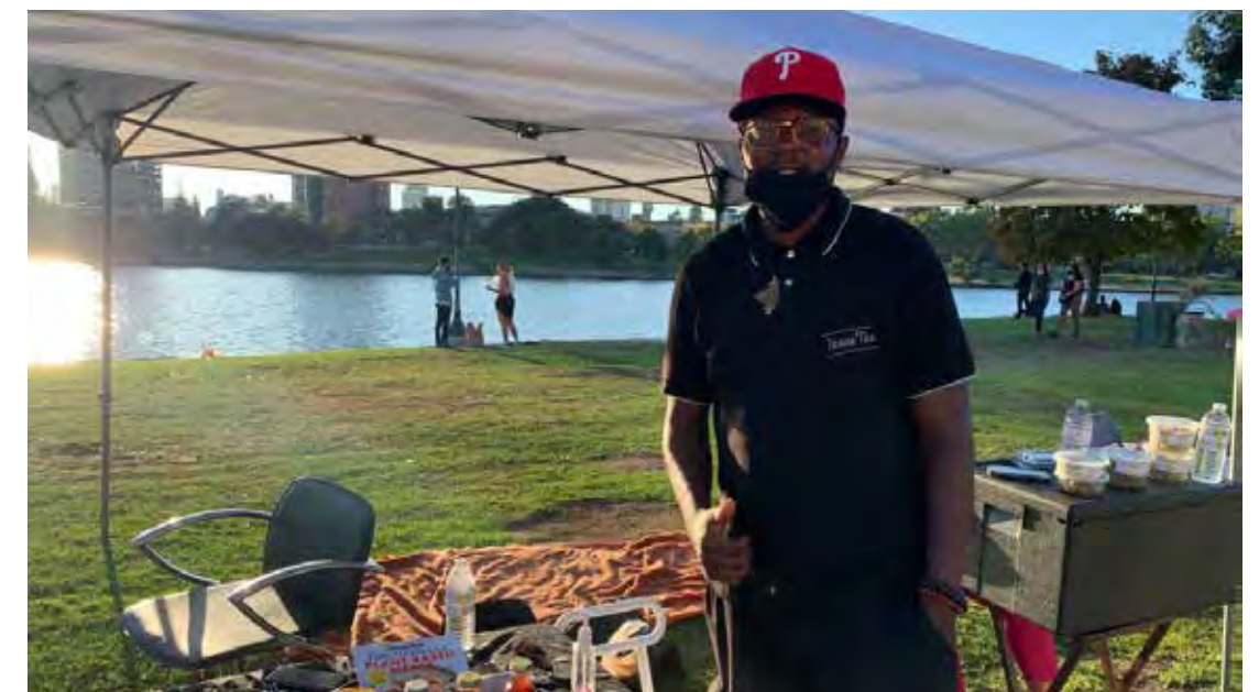
An Oakland vendor at Lake Merritt, 2023.