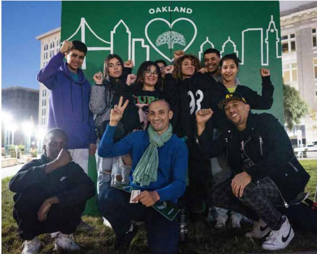
Oakland residents pose with CSIG Key Choice on Love Life Day, 2022.

In part, my project was successful because people know me; they know my work has integrity and that brought people to the table. Honestly, it was both a blessing and a challenge, in terms of how much work we had to do, to realize how much demand there was once people felt like it was a place they could trust and participate in. We ended up reaching hundreds of people in person. These projects otherwise just simply wouldn't reach these communities, BIPOC communities. Which means these projects might not even be possible without our role, or if they were, they would take years of staff effort and dedicated resources. And unfortunately, we know Oakland really doesn't have that kind of time or money right now.