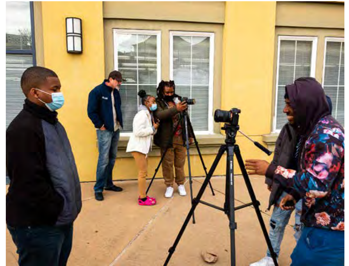
Participants in a photo and video workshop organized by CSIG Walter Wallace. The workshops served over 1,000 Oakland residents.

"I've found that a lot of people will give up on a certain thing because they don't trust it. But like you're saying, trust has to be built, and inevitably it gets broken and has to be rebuilt again. And I think the project I was part of kind of reflected an ideal process of trust-building, it was just at a small scale."