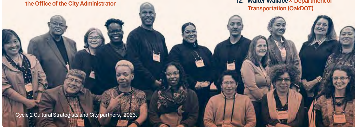
Cycle 2 Cultural Strategists and City partners, 2023.