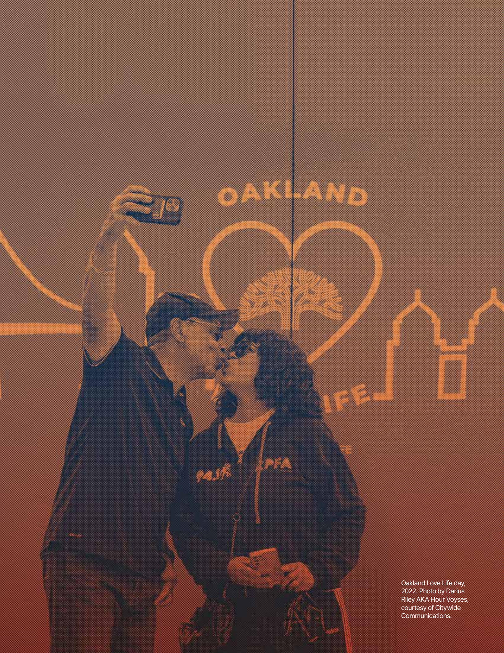
Oakland Love Life day, 2022.